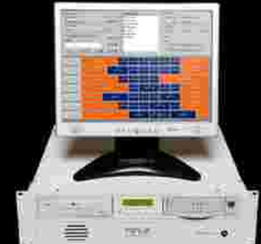
Pro kit (audio & video)